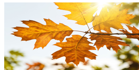
The trees are about to show us how lovely it is to let things go.

If you have some free time to spare, and would like to find out more about this volunteering opportunity, you can apply online at www.victimsupportni.co.uk or contact their Belfast Hub on 028 9024 3133 for more information on the roles.