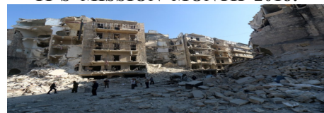
The most important day of this month is World Mission Sunday, which takes place on 21st.

This is the one Sunday in the year that Pope Francis asks us to pray a little stronger and dig a little deeper so that faith, hope and love can flourish. Contributions given on Mission Sunday will support the fearless and selfless work of our missionaries who live shoulder-to-shoulder with people in communities that are struggling and often war-torn. Mission Month is a time for us to fully appreciate their dedication before, during and after any crisis.